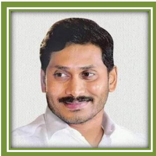
Shri Y. S. Jagan Mohan Reddy Honorable Chief Minister of AP

in Association with Centre for Gandhian Studies, ANU