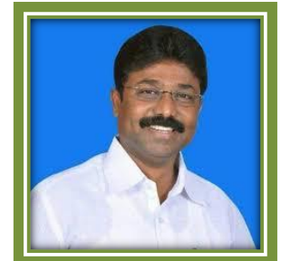
Dr. A. Suresh Honble' Minister for Education, AP