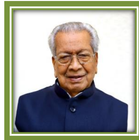
Shri Biswabhusan Harichandan Chancellor & Honorable Governor of AP